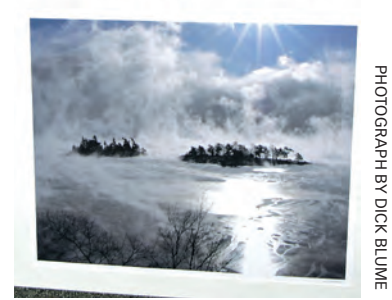
Pilot and photographer Ian Coristine has authored three photography books on the Thousand Islands.