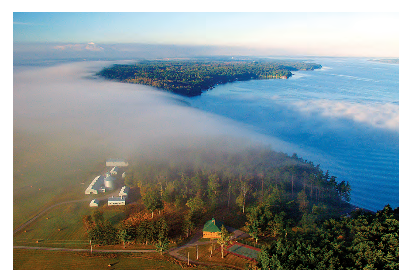
West of Bartlett Point and French Creek Bay.

FOR THE THOUSAND ISLANDS IS MILLE ILES. • NATIVE AMERICAN NAME TO THE ISLANDS IS GARDEN OF THE GREAT SPIRIT. • THE ST. LAWRENCE SEAWAY TOOK FOUR YEARS TO BUILD, BEGINNING IN 1955. (SOURCES: "PICTORIAL HISTORY OF THE THOUSAND ISLANDS" AND THE ST. LAWRENCE RIVER RESTORATION COUNCIL)