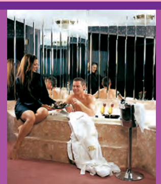
Subtle sophistication & casual elegance in the heart of the beautiful Thousand Islands.